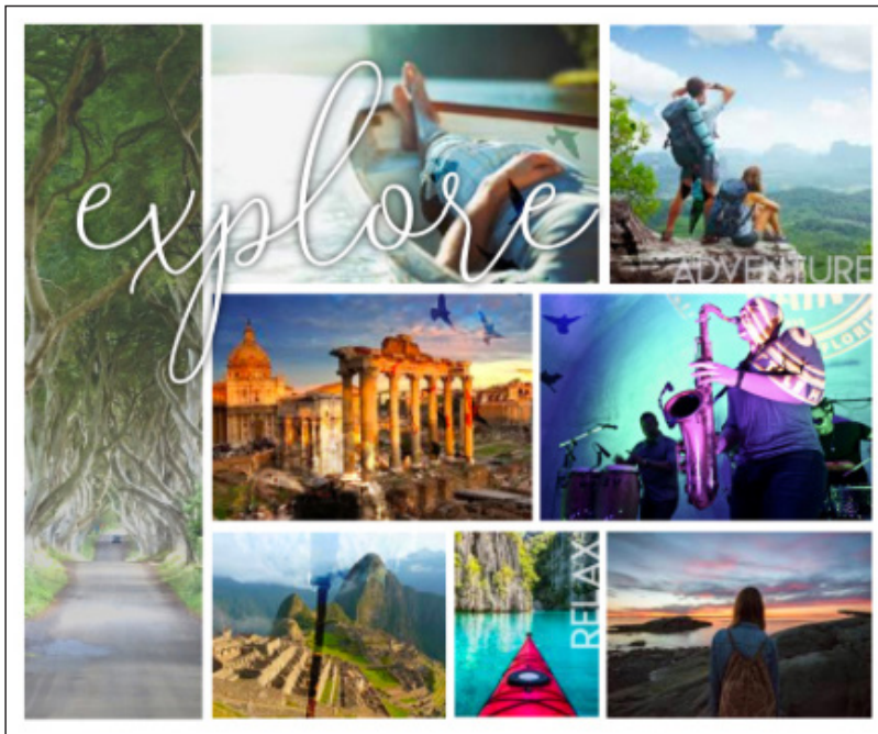
Example of a Mood Board for Explore - travel app